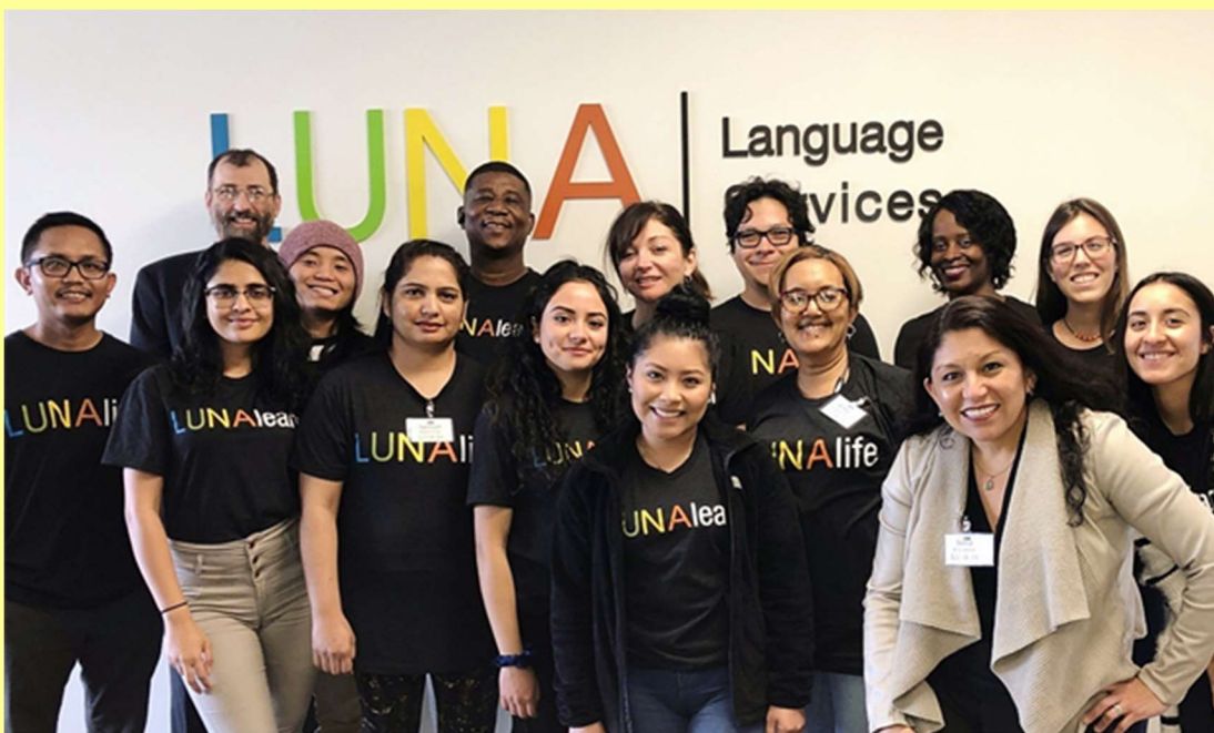
LUNA offers Bridging The Gap training at LUNAcademy, a training center located in Central Indiana, and at Washington Township Adult Education Center as a means to recruit new interpreters.