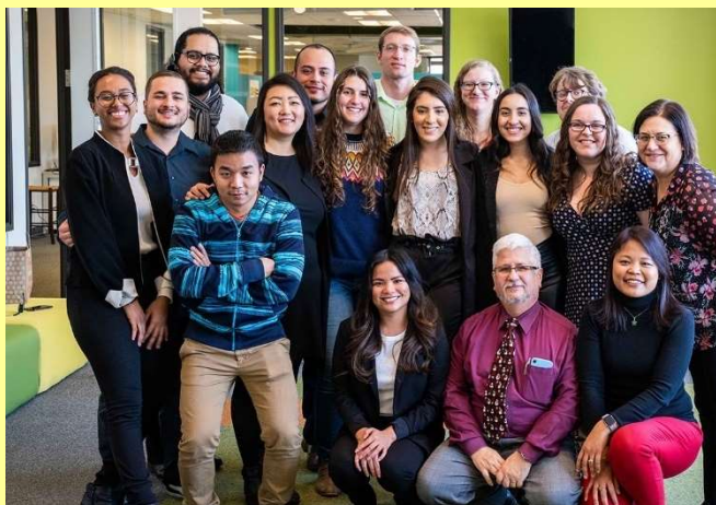
LUNA’s entire Coordinating Team are multilingual, experienced, and truly caring in all ways.