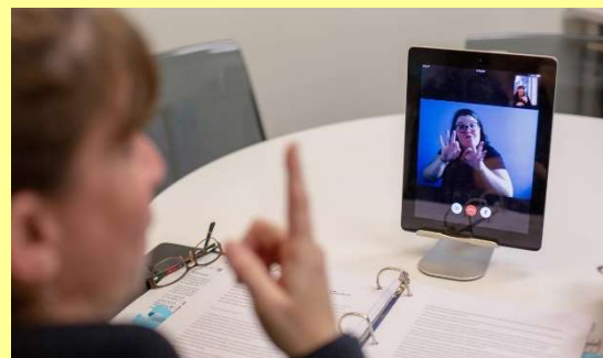
LUNA staff in a VRI demo.

Virtual Online Interpreting: Used when all parties are in different remote locations .