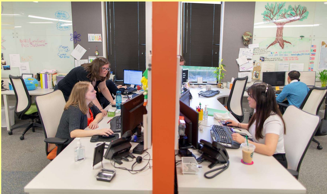
The LUNA office is staffed seven days a week and ready to take client calls 24 hours a day. Coordinators are fluent in the state's most common languages and can help client's identify language needs.